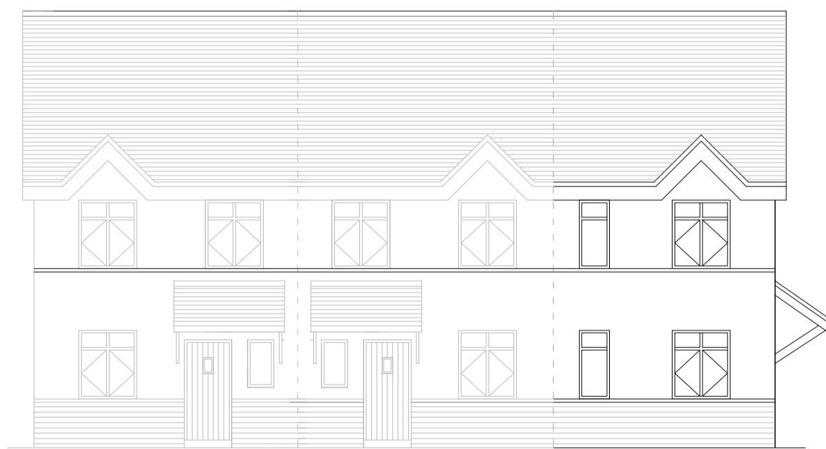
Proposed Front Elevation 1:100