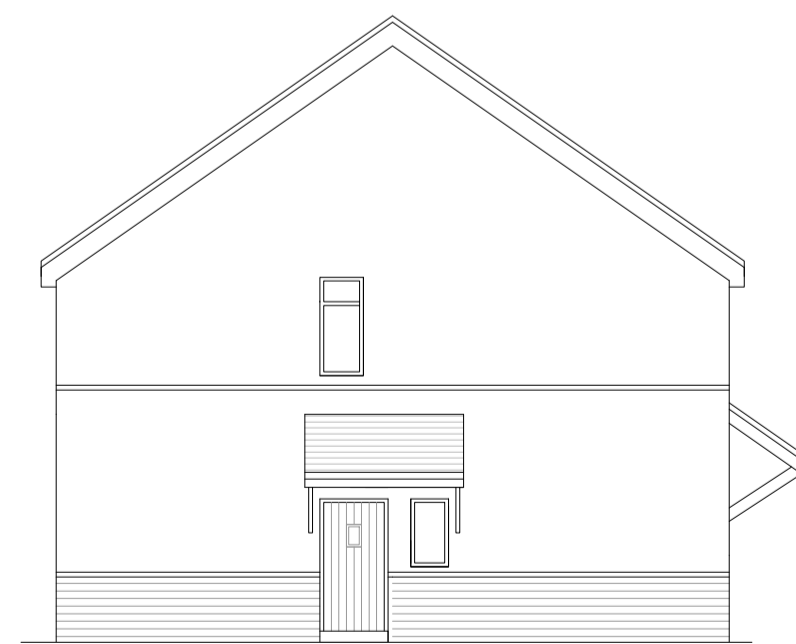
Proposed Side Elevation 1:100