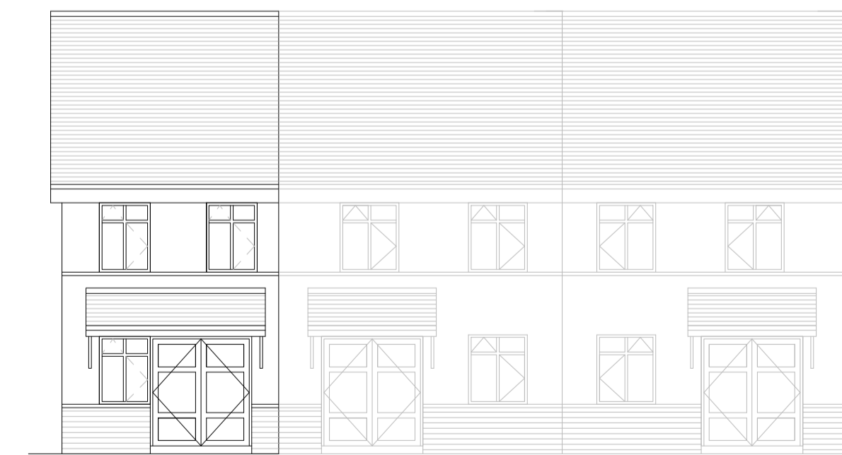
Proposed Rear Elevation 1:100